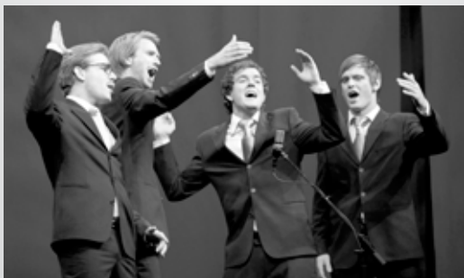
Swedish Match, 2010 Collegiate Quartet Champion

Visit www.barbershop.org/college for more details on how to register!