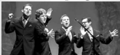
The Newfangled Four, 2013 Collegiate Quartet Champion

For more details on how to register, visit www.barbershop.org/college